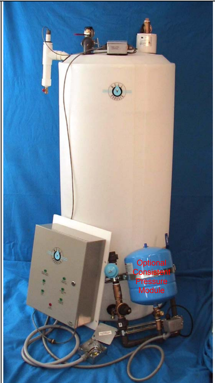
Model Shown: WM160M-50LPC with the optional CPM50100 Consistent Pressure Module

When system storage is correctly sized water stays cold and fresh