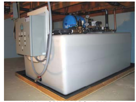
WM210CPLH-50LPC 39" High

Using a Spray Boom Fill for odor, flammable gas or Radon removal requires the addition of a power vent to the exterior of the building.