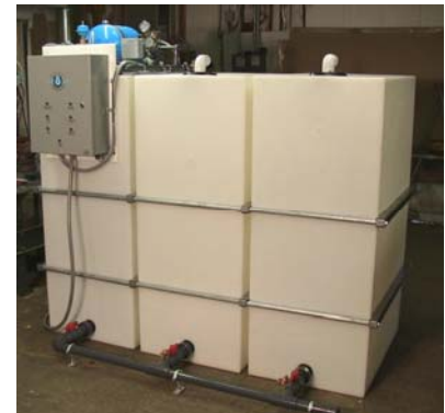
WM210CPV with extra tanks 74" High