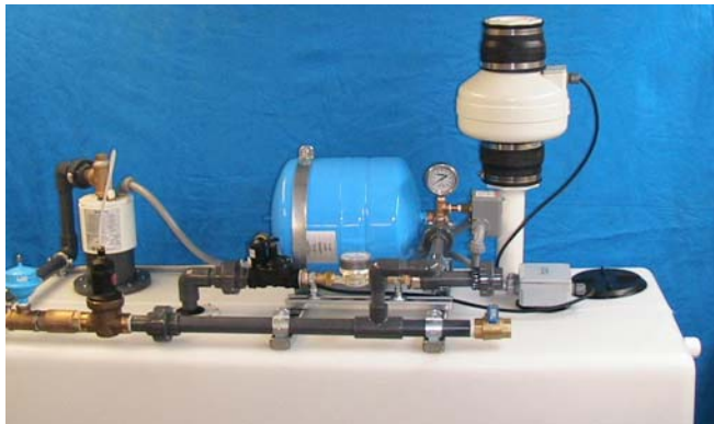
Unit with a spray boom and blower that runs as tank is filling