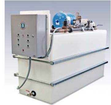
WM210CPH 49" High