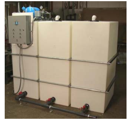
WM210CPV with extra tanks 74" High