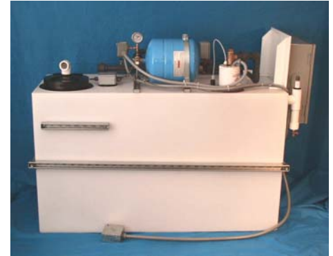
Side View of a WM210CPH 49" High

Using a Spray Boom Fill for odor, flammable gas or Radon removal requires the addition of a power vent to the exterior of the building.