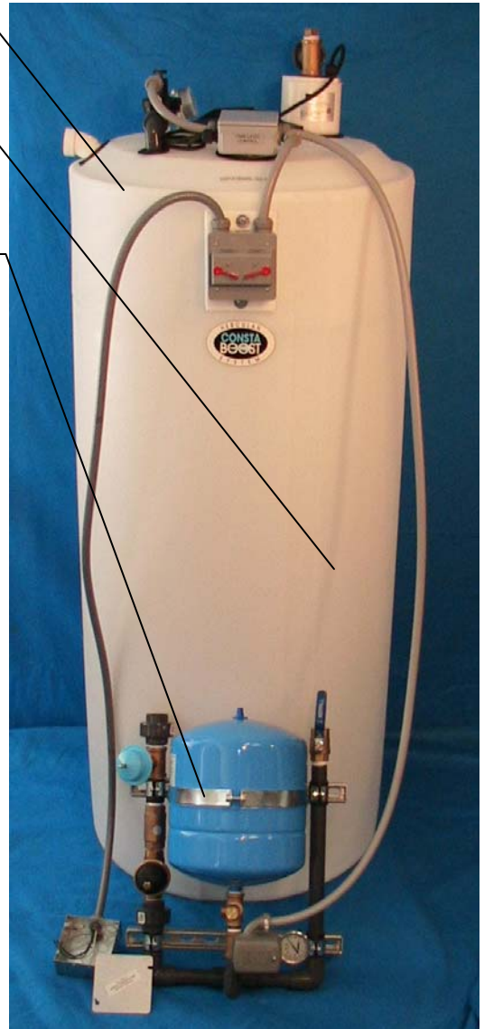
Model shown SSPB-160WS50-LPCEF 28" Diameter system goes through small doors